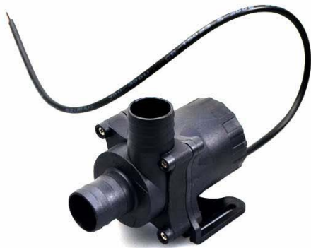
T series (two phase)