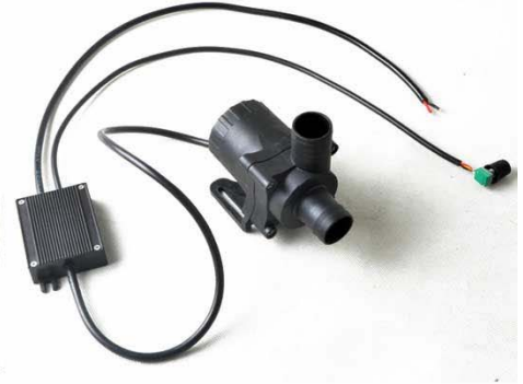
A series (three phase)