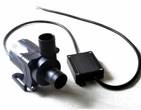
S series (three phase)